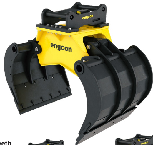
With teeth (accessory)

The EC-Oil automatic quick hitch system is a free standard on all engcon's hydraulic tools with S40–S80 attachment.