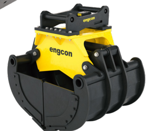
With closed sides (accessory)