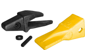
Tooth kit, type Cat