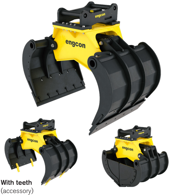
With teeth (accessory)

*Applies to grabs with S45–S80 quick hitch top brackets.