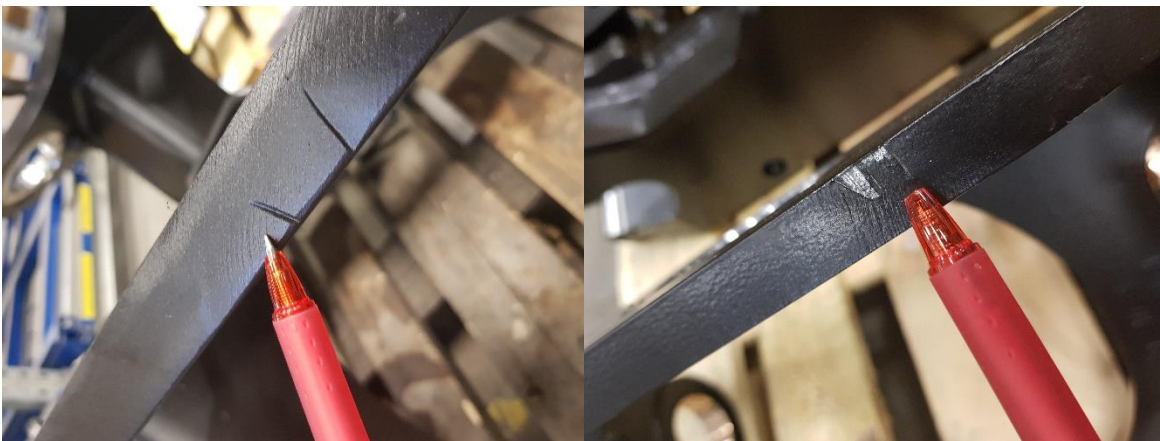
Example not permitted damages