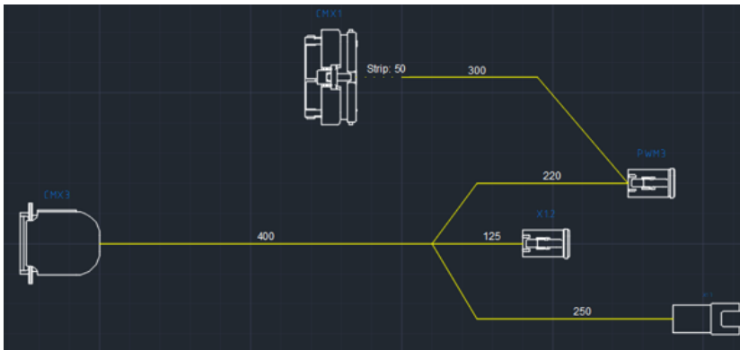
Example chain dimensioning

All measurements are found on the overview page and are in millimeters (mm). Cable lengths are specified using chain dimensioning for the segment in question up to the next branching or stripping, as shown in below picture. Total cable length is found by summarizing the lengths for the individual segments. Other measurements are specified using dimension arrows.