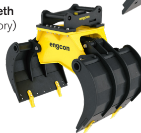
With teeth (accessory)

*Applies to grabs with S40–S80 top brackets.