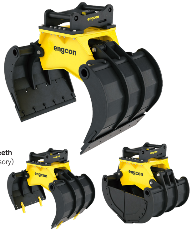
With closed sides (accessory)

The EC-Oil automatic quick hitch system is a free standard on all engcon's hydraulic tools with S40–S80 attachment.