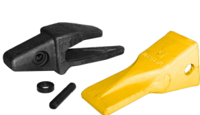
Tooth kit, type Cat